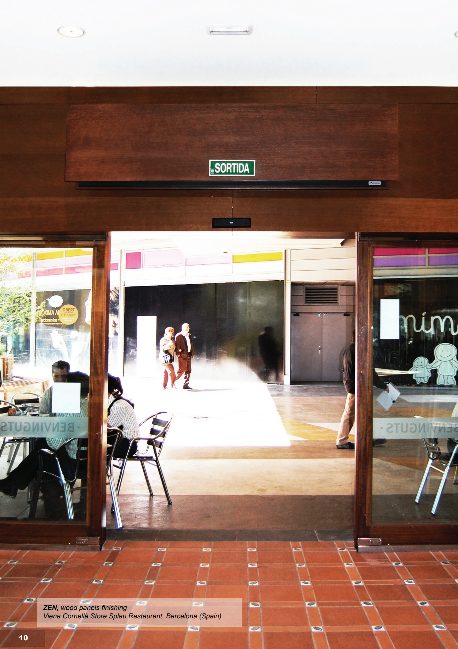
ZEN, wood panels finishing Viena Cornellà Store Splau Restaurant, Barcelona (Spain)