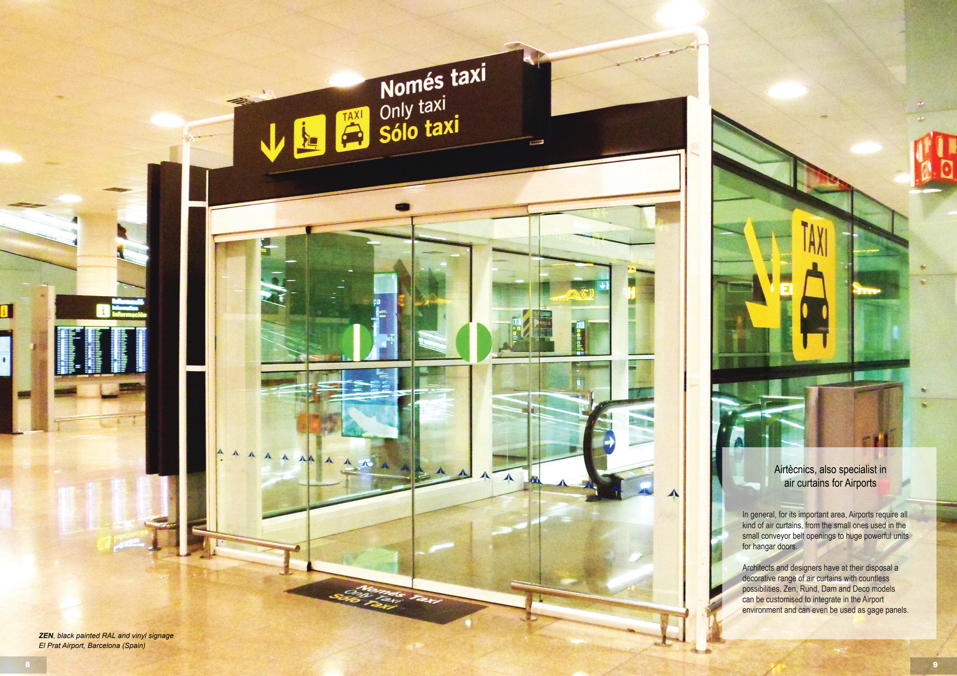
ZEN, black painted RAL and vinyl signage El Prat Airport, Barcelona (Spain)