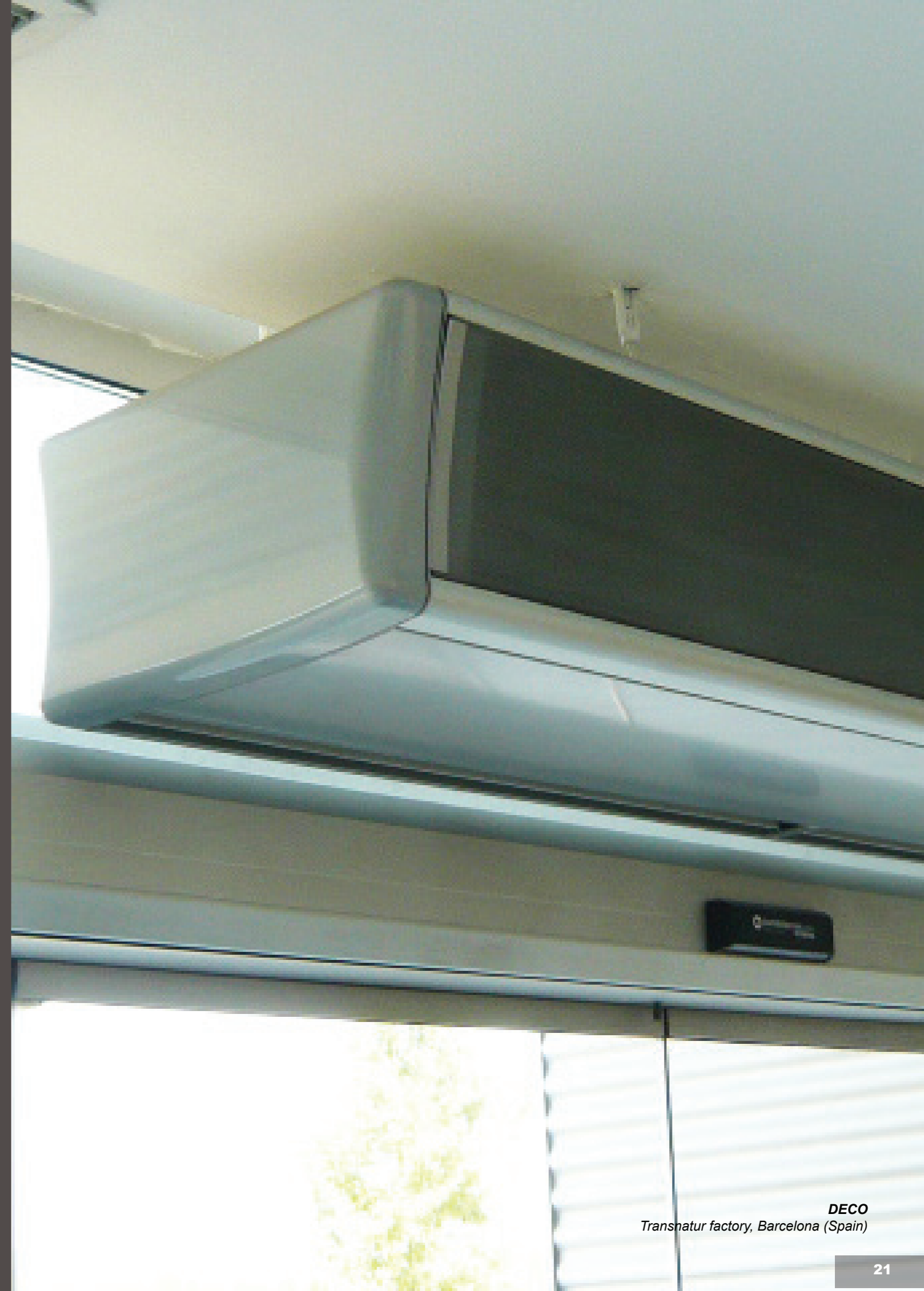
DECO Transnatur factory, Barcelona (Spain)

With steel and aluminum profiles frame structure and finished with epoxy-polyester paint gray RAL 9006. Other colors available under request.