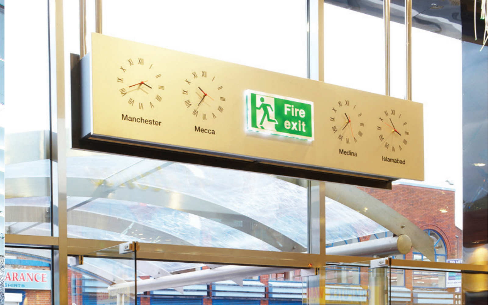
Right Up | ZEN, with aluminum panel, clocks and Exit sign Manzil Banqueting Hall Restaurant, Manchester (UK)