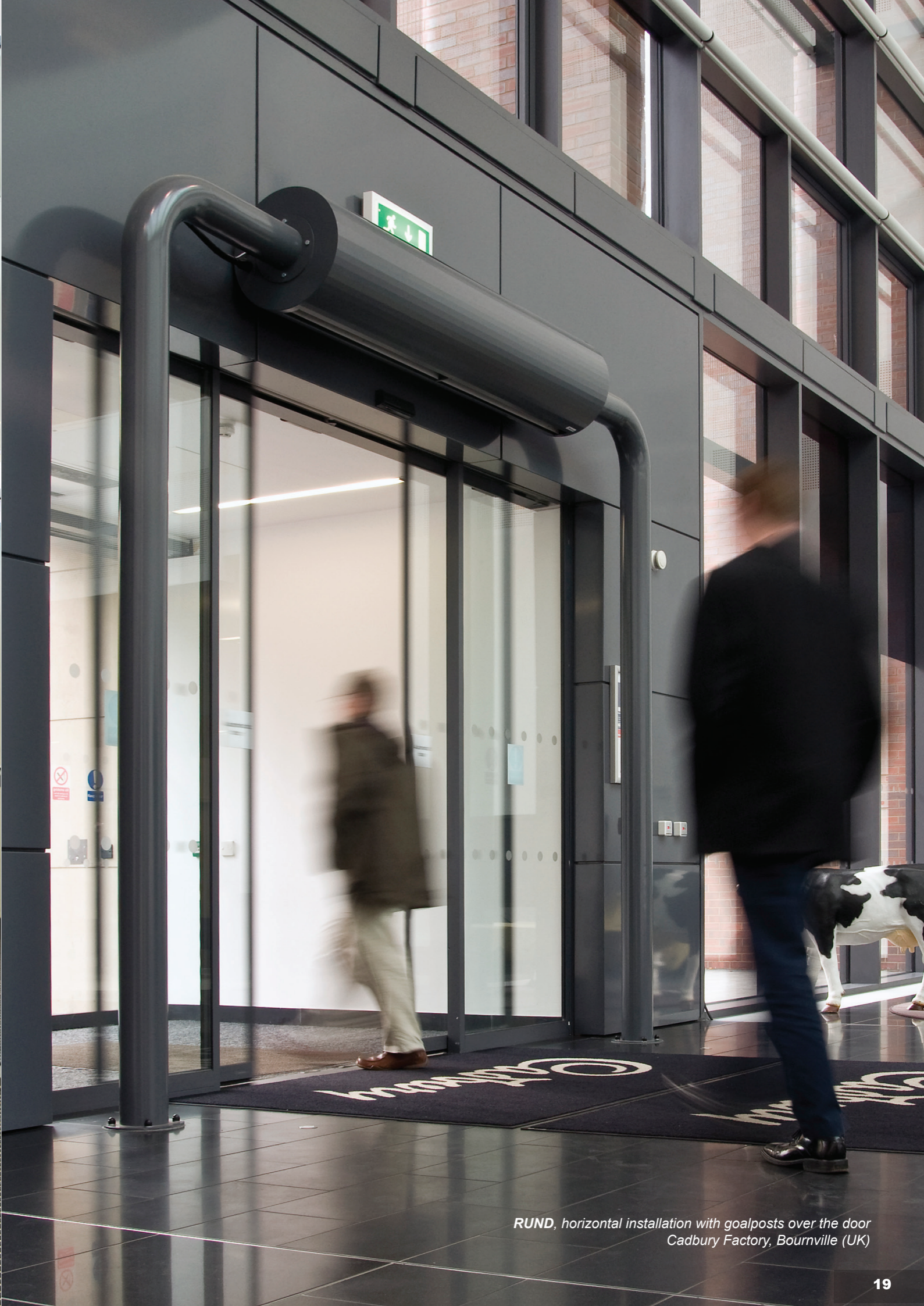
RUND, horizontal installation with goalposts over the door Cadbury Factory, Bournville (UK)