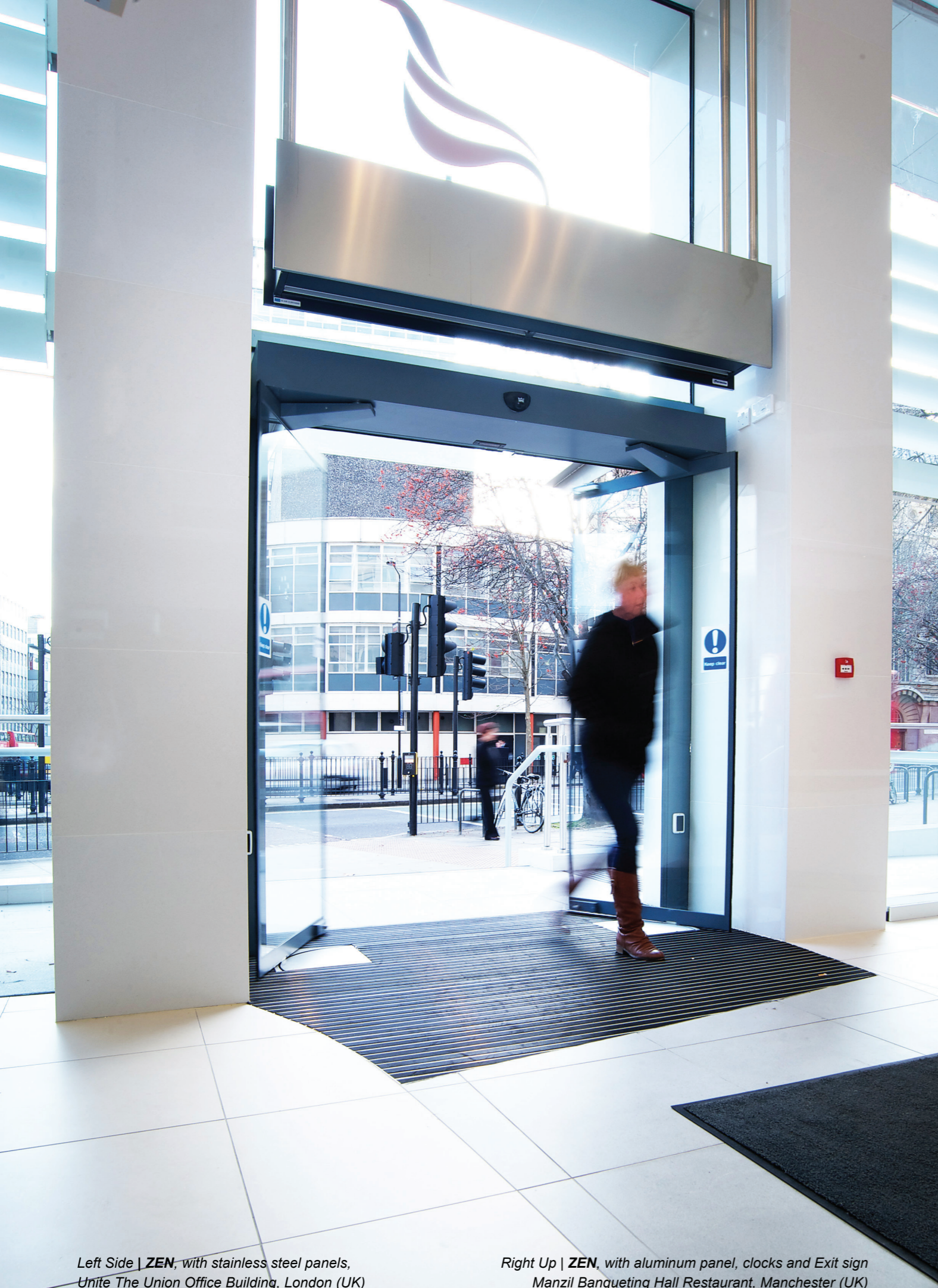
Left Side | ZEN, with stainless steel panels, Unite The Union Office Building, London (UK)