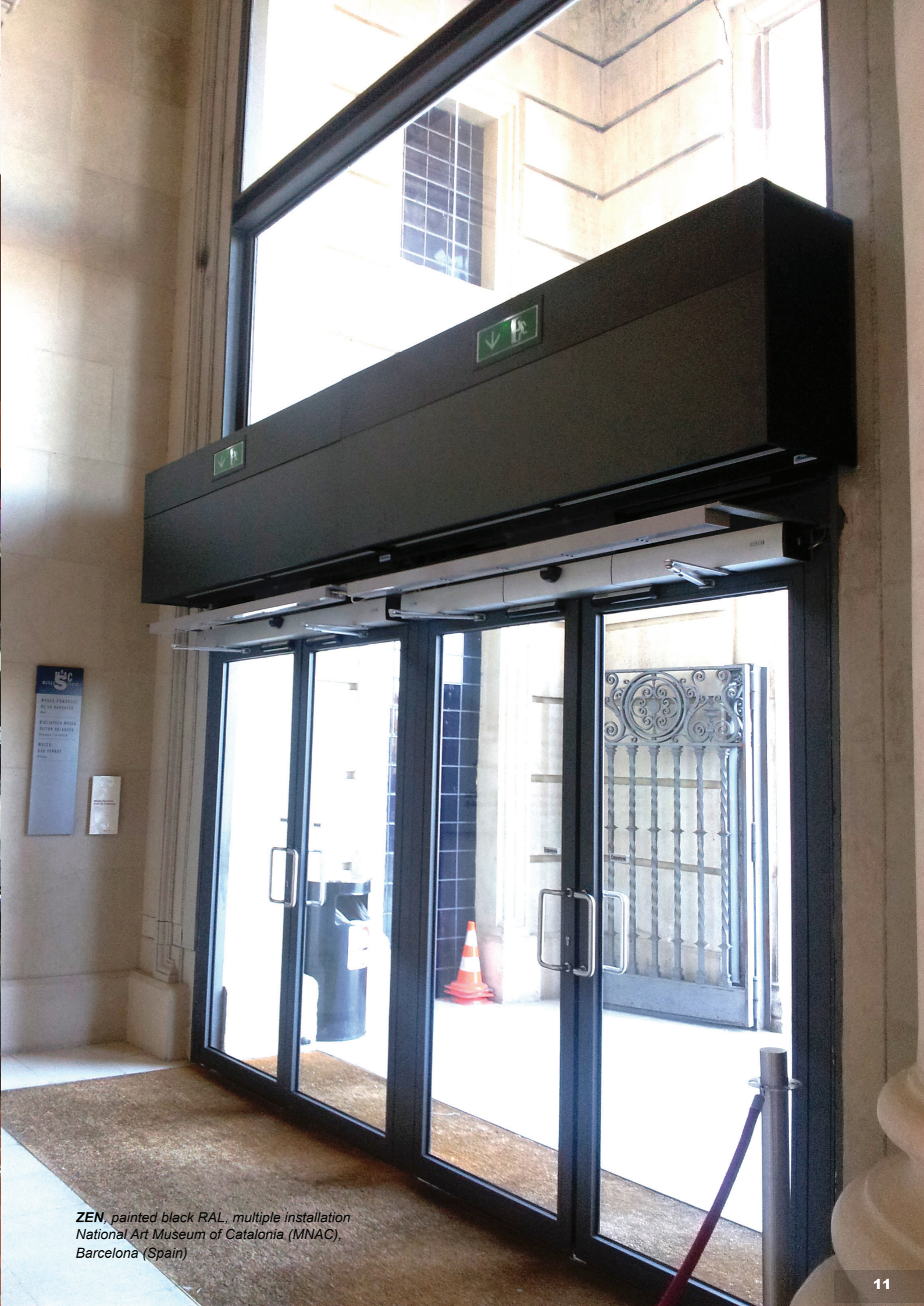
ZEN, painted black RAL, multiple installation National Art Museum of Catalonia (MNAC), Barcelona (Spain)