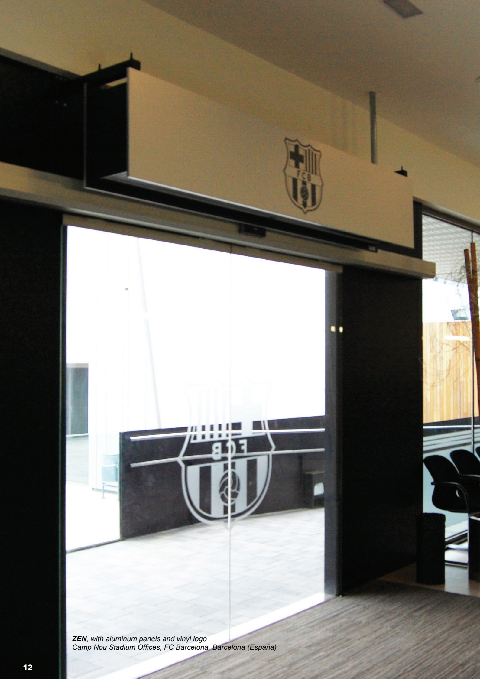
ZEN , with aluminum panels and vinyl logo Camp Nou Stadium Offices, FC Barcelona, Barcelona (España)