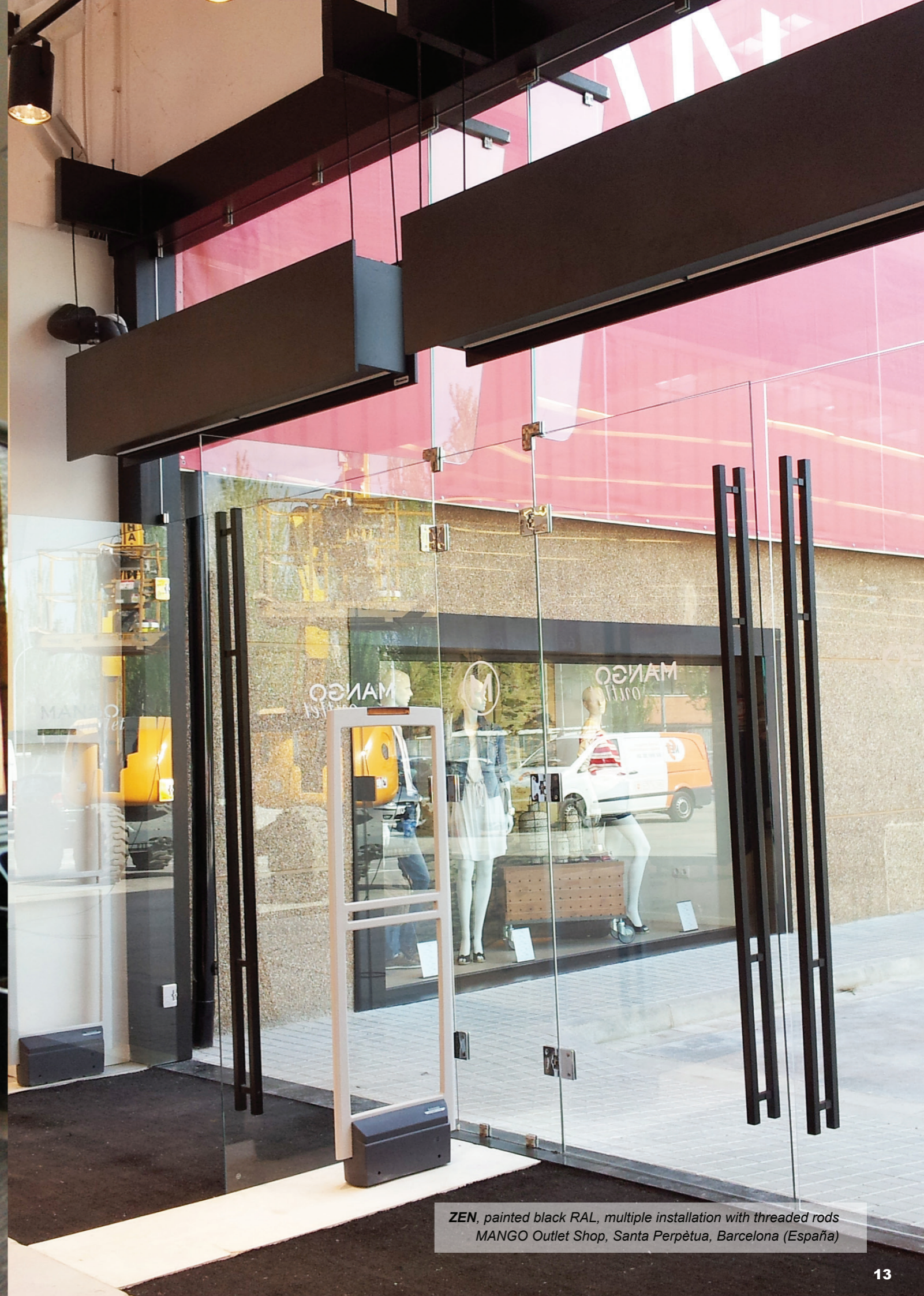
ZEN , painted black RAL, multiple installation with threaded rods MANGO Outlet Shop, Santa Perpètua, Barcelona (España)