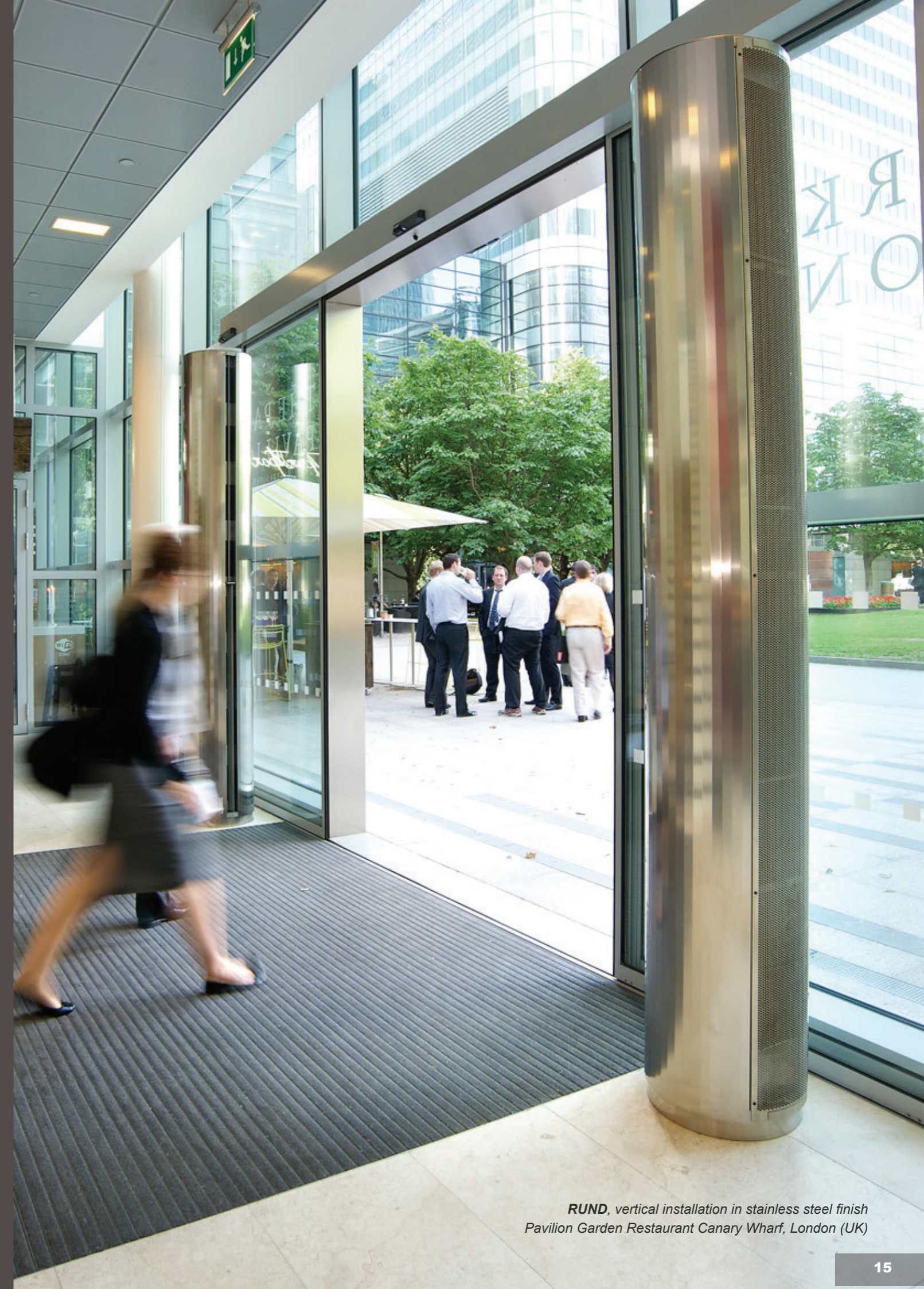
RUND, vertical installation in stainless steel finish Pavilion Garden Restaurant Canary Wharf, London (UK)

With self-supporting steel frame panels, finished in epoxy-polyester paint RAL 9016 white or gray RAL 9006 as standard. Other colors or stainless steel polished finishes available under request.