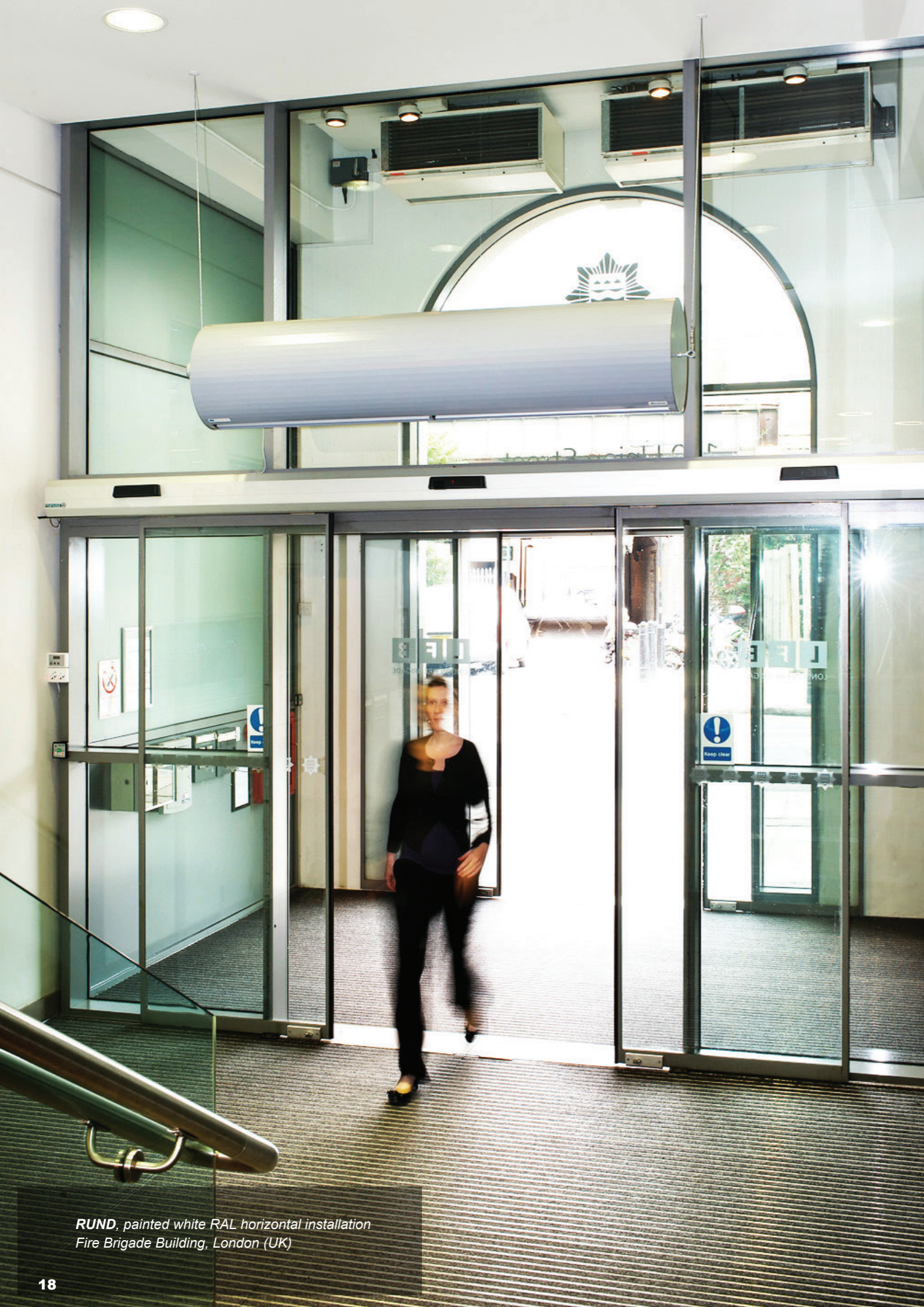
RUND, painted white RAL horizontal installation Fire Brigade Building, London (UK)